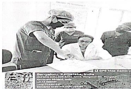
Students performing the suturing techniques