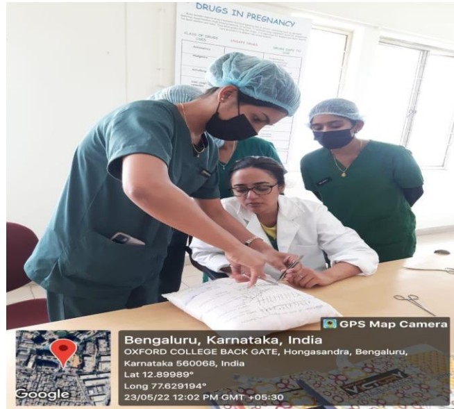
Suggestion of corrective measures

(Recognized by the Govt. of Karnataka, Affiliated to Rajiv Gandhi University of Health Sciences, Karnataka & Recognised by Dental Council of India, New Delhi) Bommanahalli, Hosur Road, Bangalore – 560 068. Ph: 080-61754680 Fax : 080 – 61754693E-mail:deandirectortodc@gmail.com Website: www.theoxford.edu