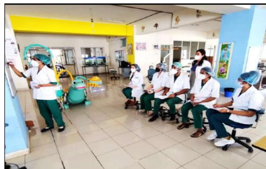
OBSERVING THE PRESENTATION