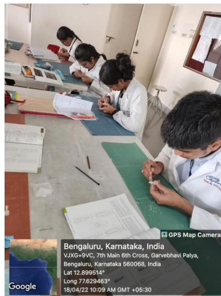
Students Carving teeth on wax block