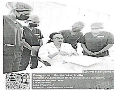
Demonstration on suturing technique

A demonstration is given to the students on the preclinical suturing techniques performed on a pillow bed. The students are asked to perform the various suturing methods following which assessment of the preclinical skills is done by grading and maintenance of their record book.