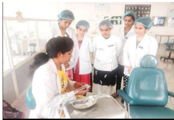
DEMONSTRATION OF CAVITY PREPARATION

A demonstration is given to the students on the preclinical cavity preparation performed on a extracted tooth . The students are asked to perform the various cavity preparation following which assessment of the preclinical skills is done by grading and maintenance of their record book.