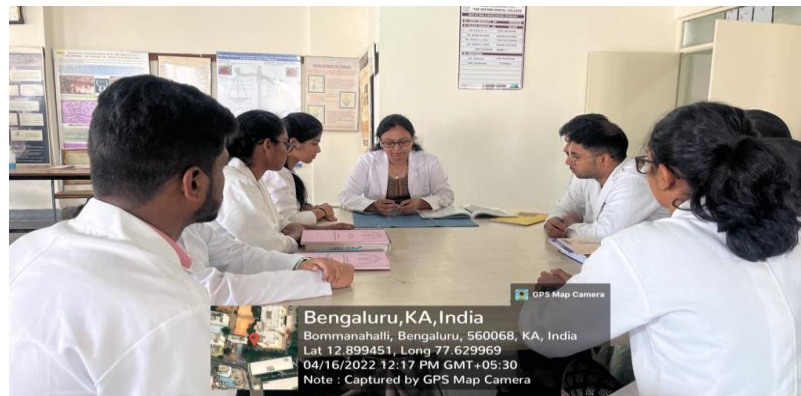
Demonstration of Tooth carving

Students are trained in carving of teeth first by demonstration by the faculty following which students are instructed to carve the teeth on their own on the wax blocks. The faculty then assesses the students work and suggests the corrective action, following which the scoring is done and maintained in record books.