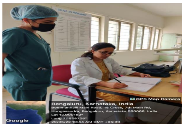
Assessment and grading